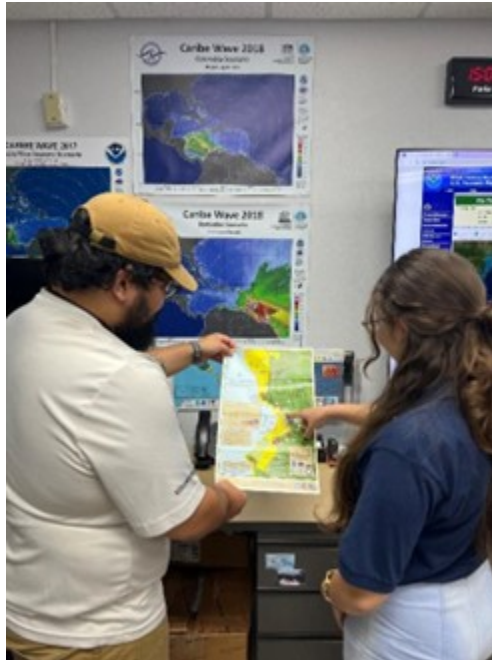
ITIC-CAR contractors reviewing a local evacuation map during CARIBE WAVE 23.