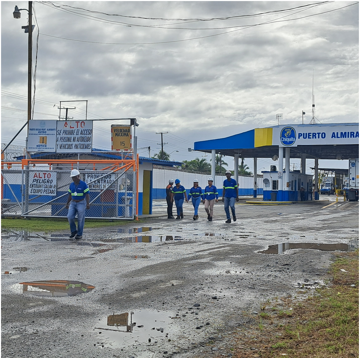
Caribewave23 exercise in Panama