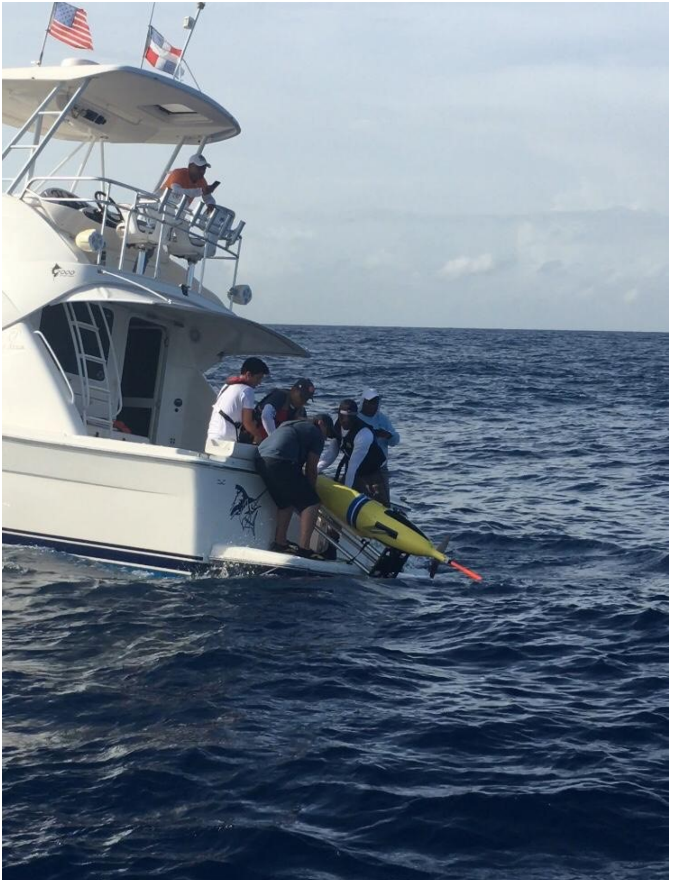
16 Agosto 2019